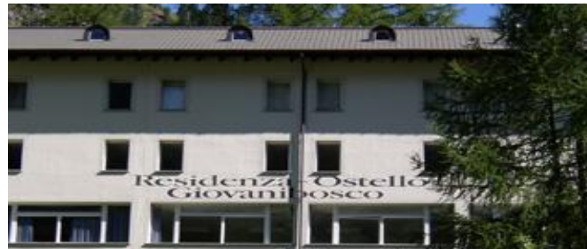
Dojo Residenza Ostello Giovanibosco

All participants must be privately accident-insured, also for medical treatment or hospitalization in Switzerland.